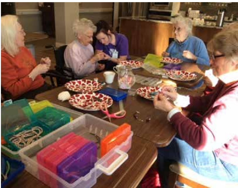
Gettin' crafty as a group back in February!