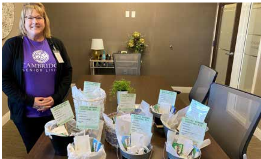
"Survival Kits" for Social Workers for World Social Work Day.