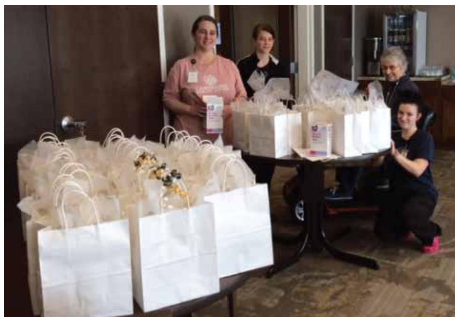
Staff and residents enjoyed assembling "first time mom" kits to donate to the Pregnancy Help Center. They were so appreciative!!

We are always looking for ways to give back to our amazing community! Here is just a quick look at a few projects that we've completed over the last two months.