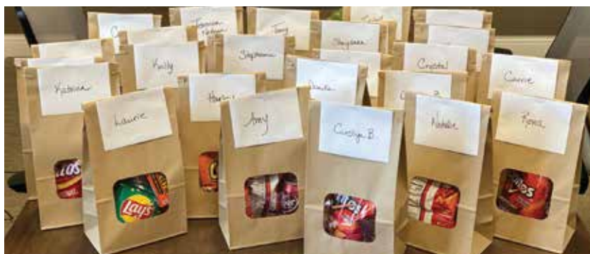
Customized snack bags for employee appreciation day!